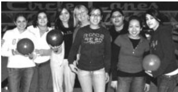
The ladies of the Morton College Classified Chapter make up a formidable team.

The Morton Classified Chapter sponsored an after-in-service bowling and pizza party at Circle Lanes in Forest Park on Friday, February 15.