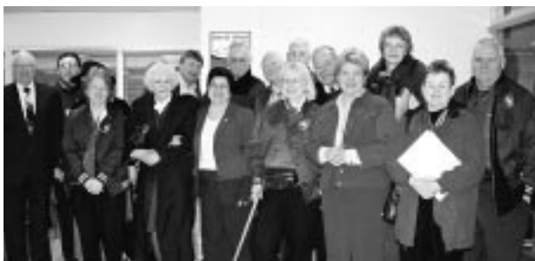
Local 1600 Retirees gather for a photo in the Stratton Building cafeteria before heading out to the rally during Lobby Day.