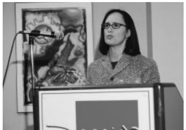
Illinois Attorney General Lisa Madigan addresses the Union House of Local 1600 on March 10.