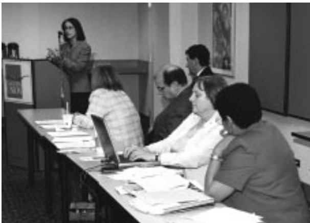
Local 1600 leaders listen to Illinois Attorney General Lisa Madigan discuss the upcoming November elections.