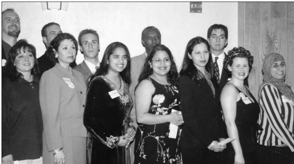
The Norman G. Swenson scholarship winners were honored at the union banquet, with each scholar winning $1,000.

The Voice staff honored both the Daley College union newsletter and the Triton College faculty union newsletter with its annual excellence award and a check for $500.