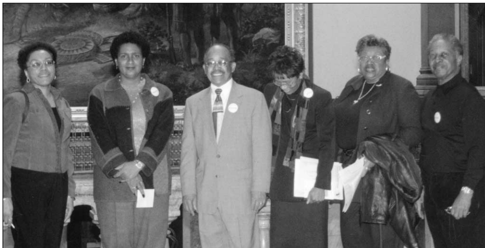
Local 1600 members visit the legislature in Springfield to lobby on collective bargaining and retirement issues.

EAGER TO SEE bargaining rights restored for the City Colleges of Chicago and to help part-time faculty organize, Local 1600 activists and retirees rallied in Springfield to lobby the legislature in April.